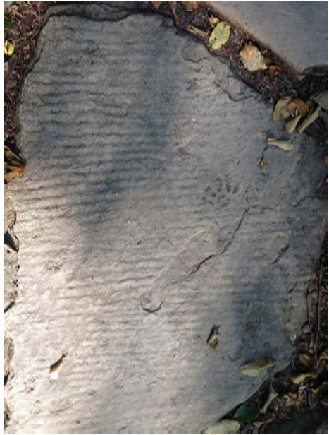
Ripple marks are visible on siltstone from the Late Devonian-Early Mississippian Period Huntley Mountain Formation.

and ripple marks. The vertical drop was around 1000 feet when we reached the Kitchen Creek confluence at Waters Meet, the lowest elevation of Falls Trail. Waters Meet is located at the top of the Devonian Period Catskill Formation which is composed of interbedded sandstone, siltstone and shale. We crossed Kitchen Creek using the wood bridge and began hiking up the other arm of the "Y" shaped gorge. This uphill hike was not as steep as the hike down but