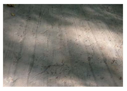
Glacial striations seen on a slab of Mississippian Period Pocono Formation sandstone eroded from the ledges above and now located along the bank of Kitchen Creek.