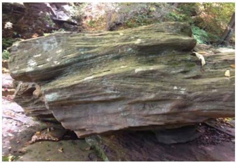
A sandstone boulder with cross bedding found along the Falls Trail.